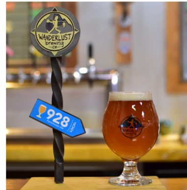
L to R: The most famous beer in Flagstaff (named after a Route 66 tourist stop in Shamrock, Texas), Historic Barrel House, Wanderlust Brewing.