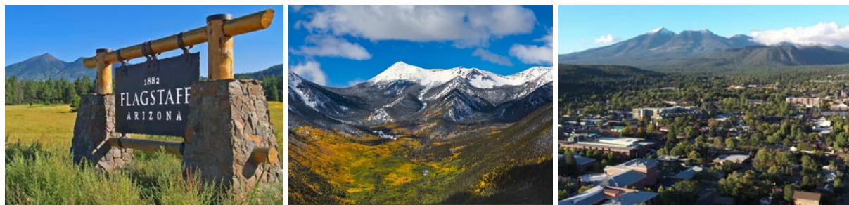
L to R: Welcome to Flagstaff, Inner Basin on the north side of the San Francisco Peaks, Aerial view of town