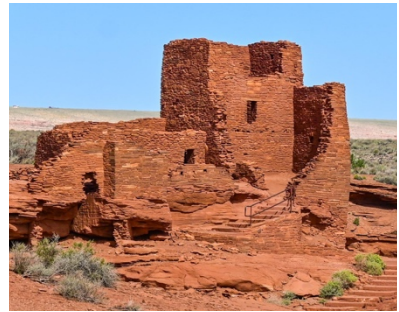
L to R: The Grand Canyon, Lava River Cave, and Wukoki Pueblo at Wupatki National Monument.