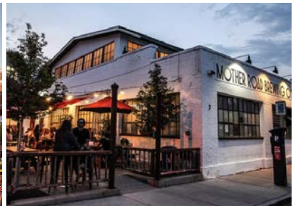
L to R: Martanne's Burrito Palace, Heritage Square, Mother Road Brewing.