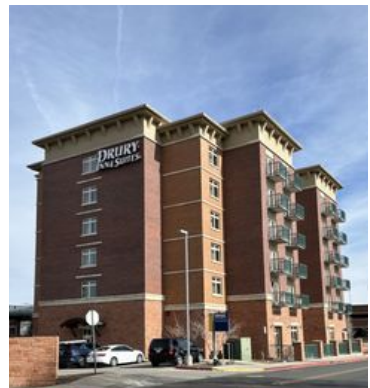
L to R: Little America Hotel, Abert's squirrel, Drury Inn & Suites.