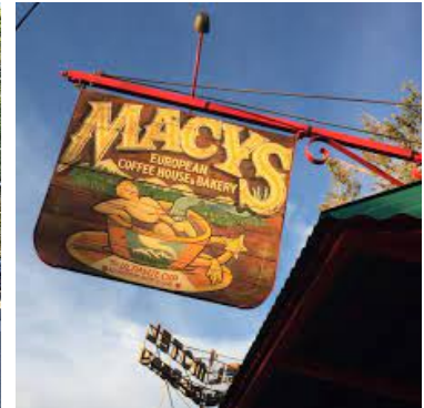
L to R: Fire Creek, Matador, Macy's.